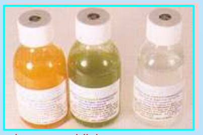
Green, brown, reddish etc. patches