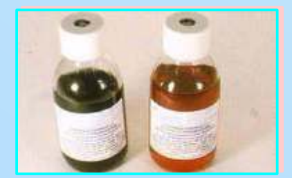
Black or yellow